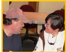
Sharing My Story...