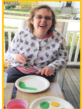
I enjoy creating my own masterpieces.