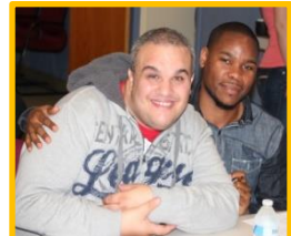
Learning together ~ building trust and respect