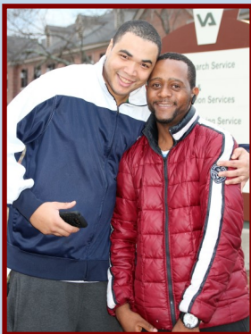
~ Proud Citizens ~ Getting Involved ~ Giving Back ~

Cooperative for Human Services Inc. 420 Bedford Street, Suite 100 Lexington, MA 02420 Telephone: 781-538-4626 Fax: 781-538-6950 www.cooperativeforhths.org VISIT US ON-LINE !