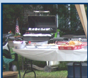
Summer Fun pg 6