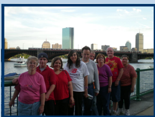
Healthy Habits page 2